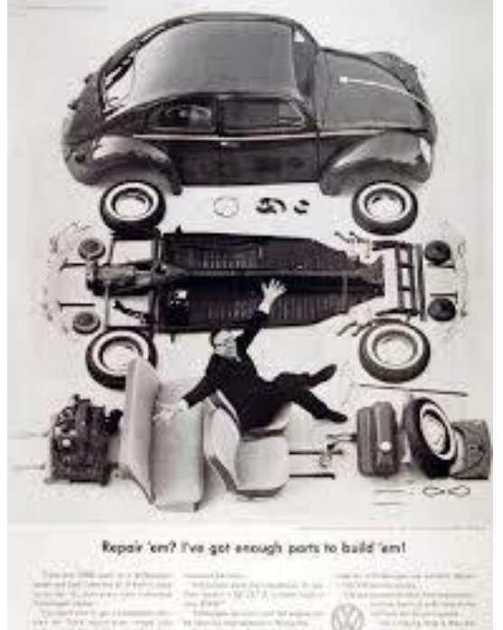
VW ads from the sixties